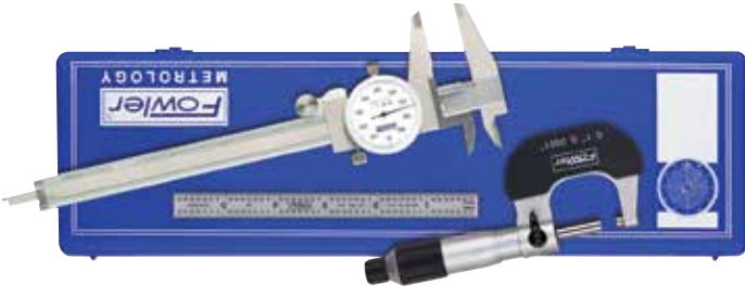
Universal Measuring Set