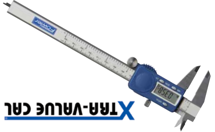
6"/150mm Electronic Calliper